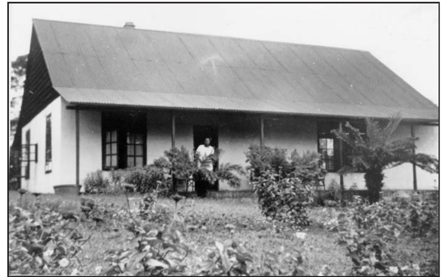
Sibusisiwe's house at Mbumbulu

Later, Sibusisiwe also organised adult education classes, and ran a small library and clinic at Mbumbulu.