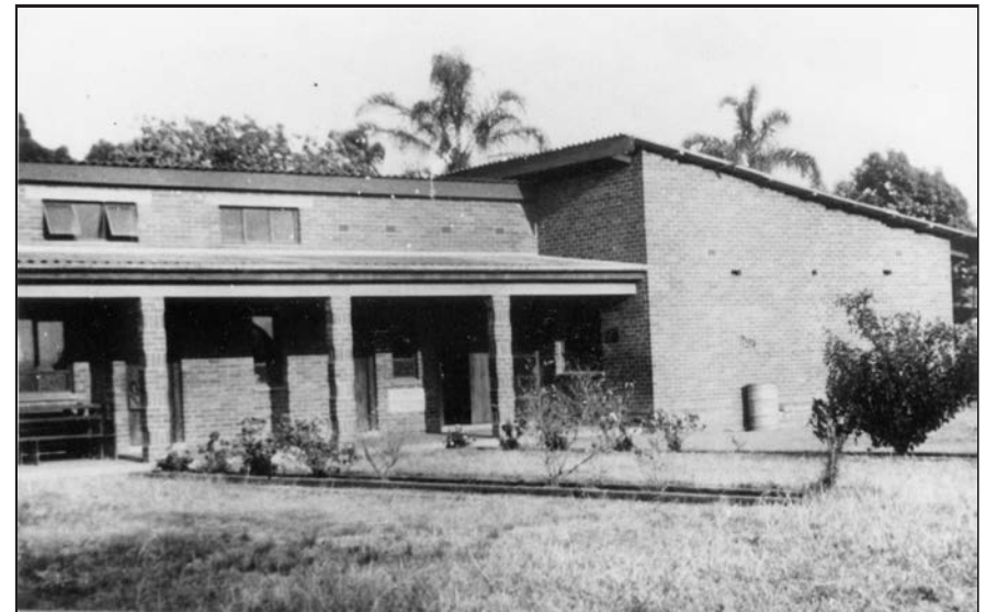
The Community Centre at Mbumbulu